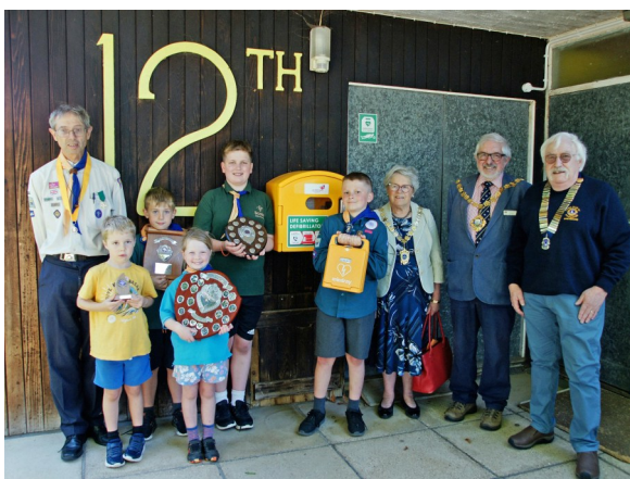
Presentation of Defibrillator to Chichester Scout Group.